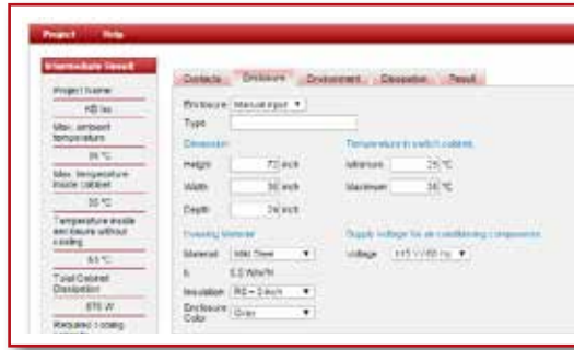
Climate Sizing Software