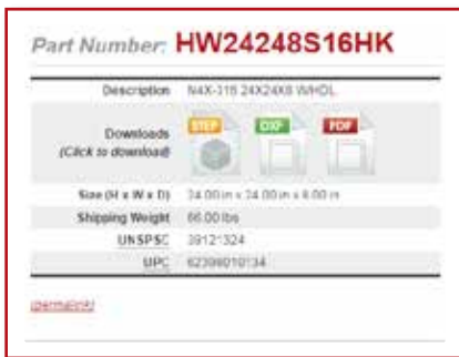
Drawing Downloads in STP DXF PDF