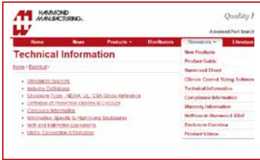
Online Technical Resources